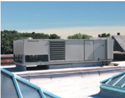
Replacement Rooftop Systems