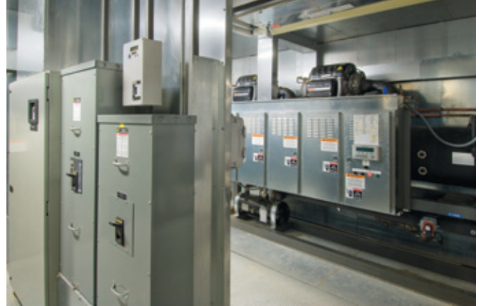
Chillers and Chiller Plants

For more information on how we can design a custom solution for you, please contact your local representative. To locate your representative, visit www.mammoth-inc.com .