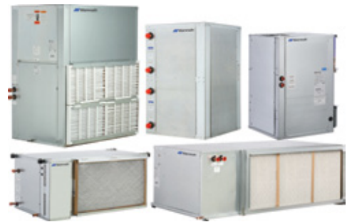
Water Source Heat Pump Systems