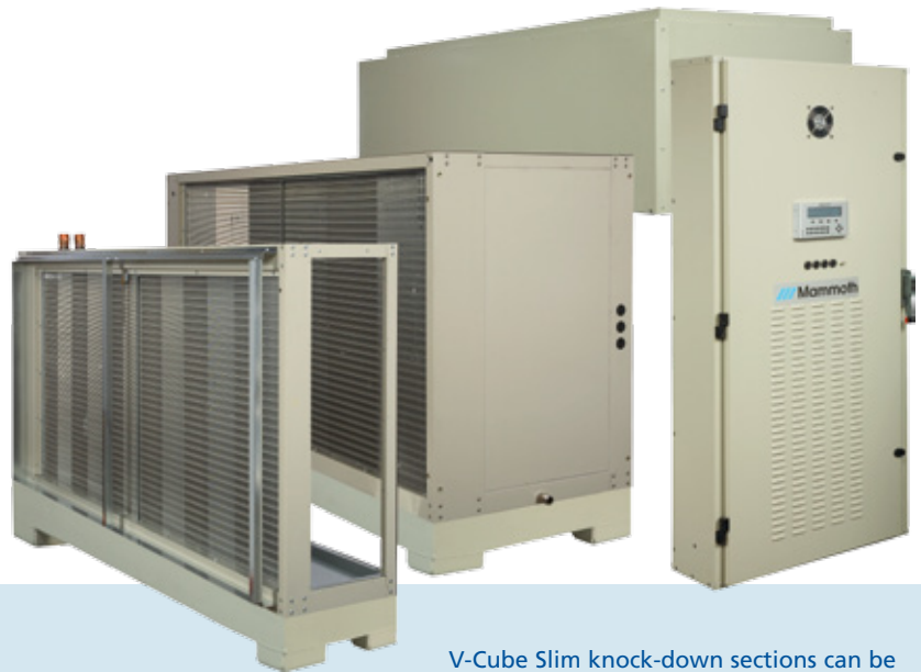
V-Cube Slim knock-down sections can be navigated through standard 3-foot doors and easily reassembled.