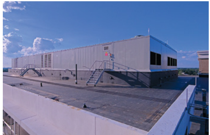
Custom Packaged DX Systems